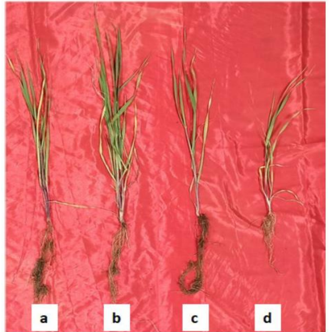
a,b,c – варианты с Pseudomonas gessardii d - контроль

2 Department of Botany, Institute of Science, Banaras Hindu University, Uttar Pradesh, India